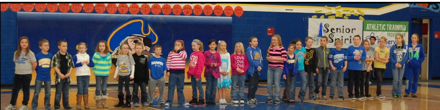
Elementary students wait to receive their awards for having all A's during the first semester of school.