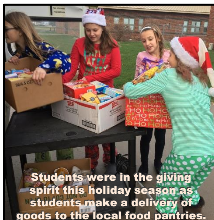
Students were in the giving spirit this holiday season as students make a delivery of goods to the local food pantries.

Student Councils from the elementary, junior high, and high school sponsored the 9 th annual food drive in December. Over the course of a week, students competed against other classes and as a whole building to strive for goals that were established. Between the two buildings, students brought in more than 4,300 goods. Goods included canned foods, paper products, boxed goods, and some personal hygiene products. Items from the food drive were split between the food pantries at the Dupont Church of the Brethren and the Continental United Methodist Church.